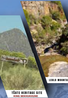
TSATE HERITAGE SITE KING SEKHUKHUNE