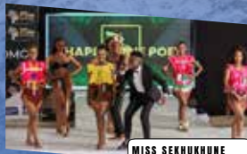
MISS SEKHUKHUNE DISTRICT