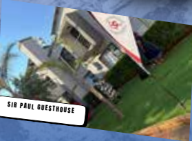
SIR PAUL GUESTHOUSE