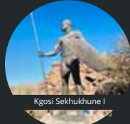
Kgosi Sekhukhune I

Visit the Kgosi Sekhukhune I and Kgosi Mampuru II statues—powerful tributes to the region's proud past. Unwind at BKT Lodge, known for its peaceful vibe, expert therapists, spa, and pool. Enjoy fishing, birdwatching, or a quiet picnic at De Hoop Dam. Take in stunning views and explore nearby villages for an authentic local connection.