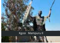
Kgosi Mampuru II