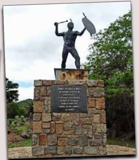
A statue of Chief Nyabela (1883) stands guard at the Mapoch Caves near Roosenekal; erected on behalf of the Ndebele Nation as a token of peace, goodwill and unity