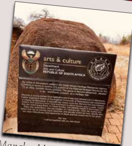
Manche Masemola, a teenage convert to the Anglican Church in Ga-Marishane, came to prominence after her death in 1928