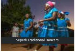
Sepedi Traditional Dancers