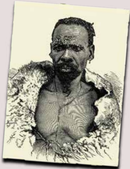
Sekhukhune was King of the Marota people (known as Bapedi) who originated from the Bakgatla of the Western Transvaal