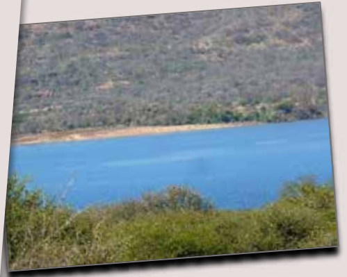
The De Hoop Dam is a gravity dam on the Steelpoort River, near Burgersfort, Limpopo