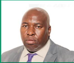
Council Speaker Cllr Kgwedibotse Chego