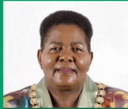
Executive Mayor Cllr Maleke Mokganyetji